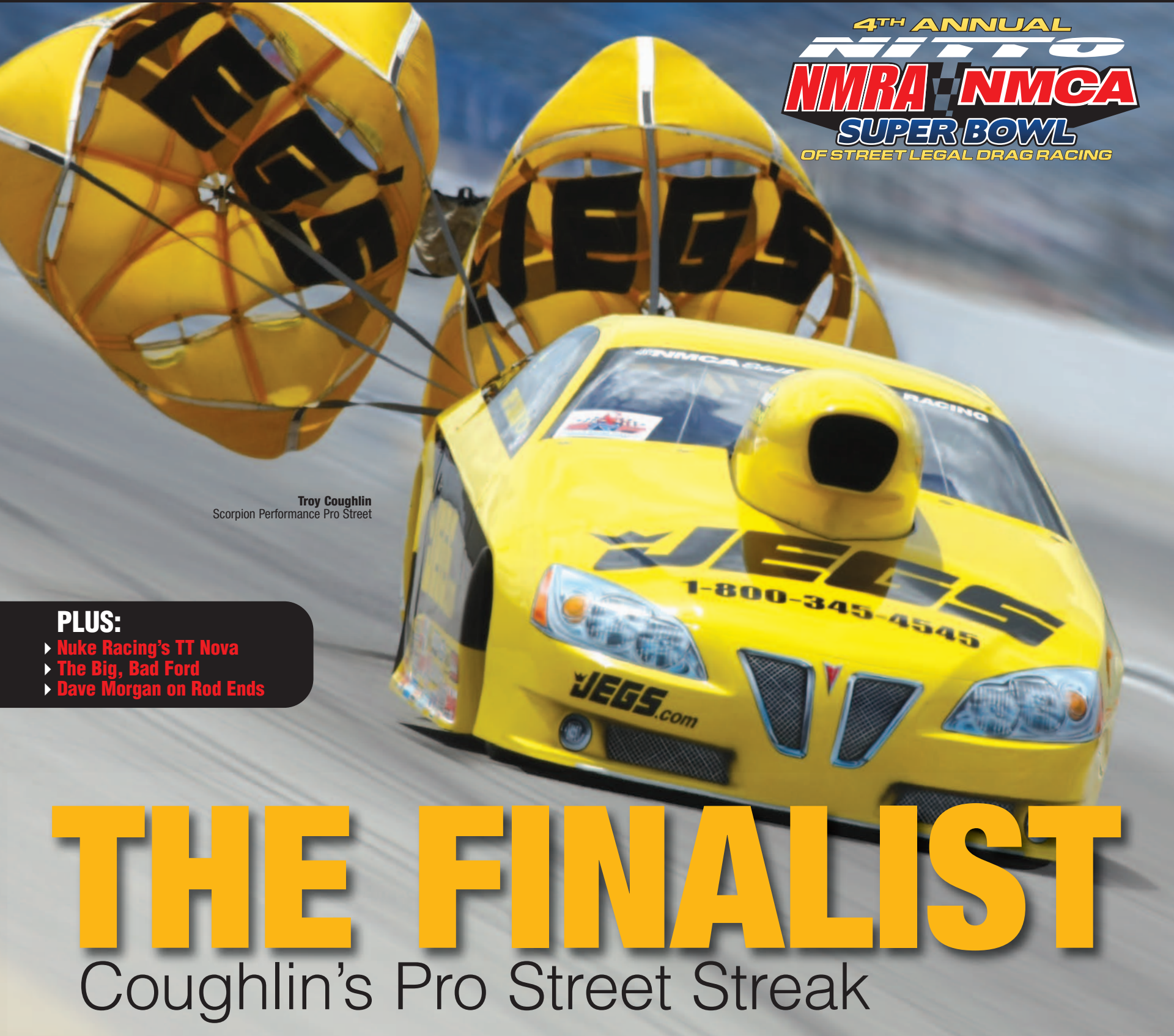
Troy Coughlin Scorpion Performance Pro Street

4TH ANNUAL NITTO NMRA NMCA SUPER BOWL OF STREET LEGAL DRAG RACING